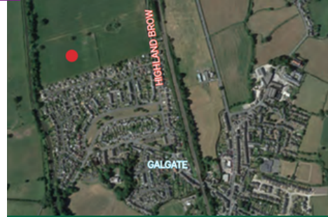
The red dot shows the site where developers want to build 115 new homes

You can view and comment on the application at www.lancaster.gov.uk/planning - search for reference no. 22/00342/FUL. Responses can be submitted any time before it goes to Planning Committee for a decision, likely to be in September - but the sooner the better. Emails should be sent to dcconsultation@lancaster.gov.uk .